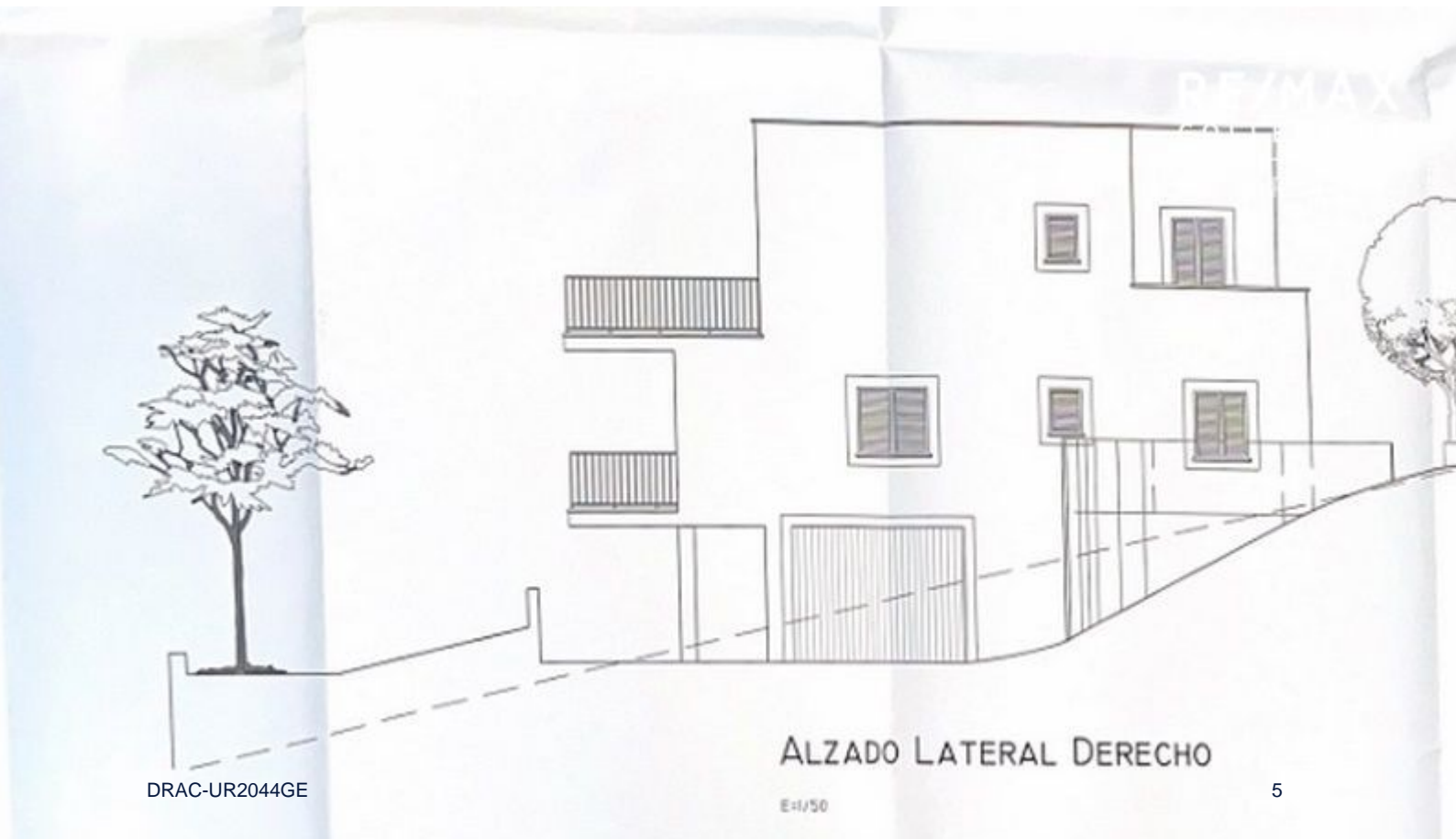
ALZADO LATERAL DERECHO